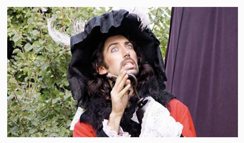
Things to Do Around Israel, March 18-24, 2016