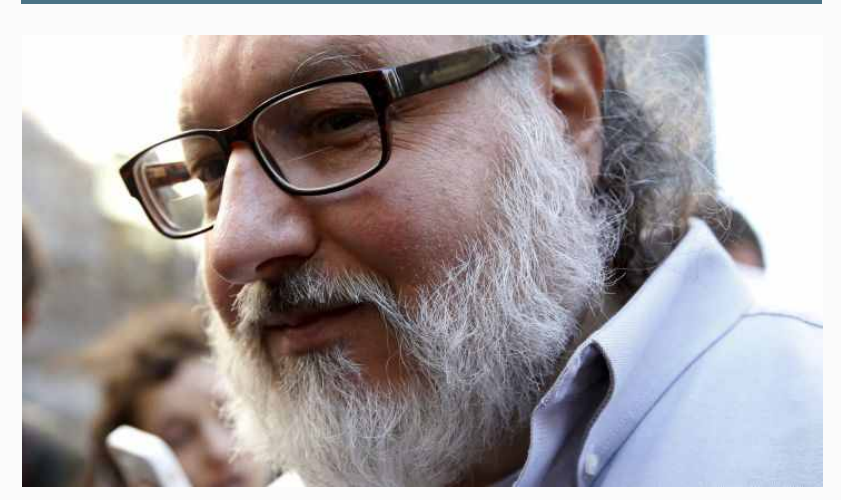
Israel to Vote on Life-long Stipend for Pollard, Despite Concerns of Harm to U.S. Ties