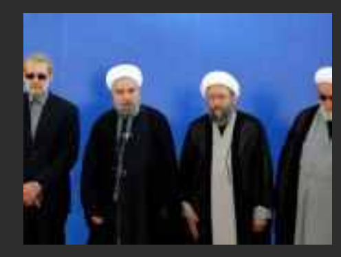
Iranian Parliamentary Committee Okays Nuclear Deal