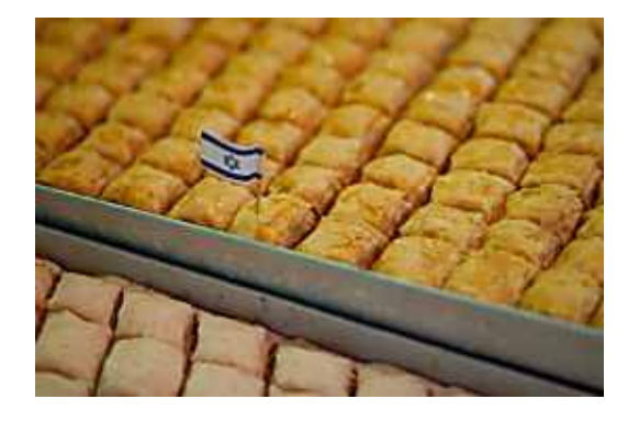
Haaretz | Opinion

The 10 Most Awesome Cars That Cost Under $18,000