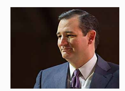
Forbes A Ranking of the 2016 Presidential