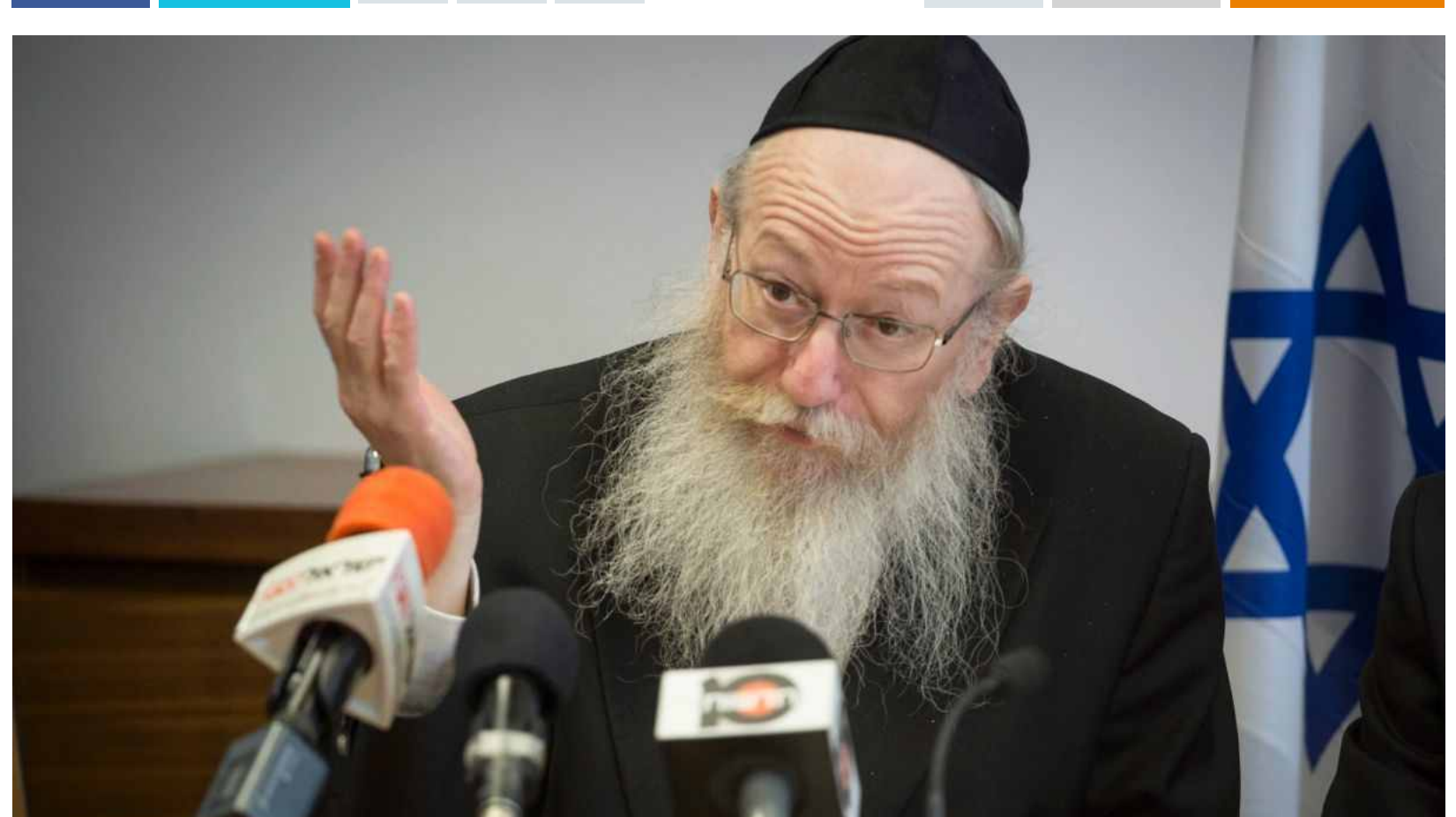
Health Minister Yaakov Litzman. Credit: Tali Meyer