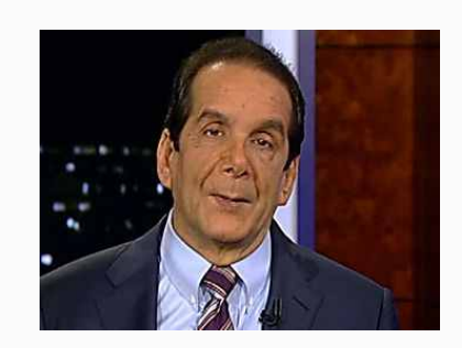
Fox News Krauthammer: Cruz 'speechless, dumbstruck'