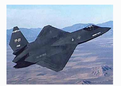
HistoryInOrbit.com 20 Fastest Jets. You Wont Believe Who Is Number 1