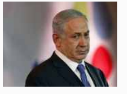
Preparing for the Day After Netanyahu