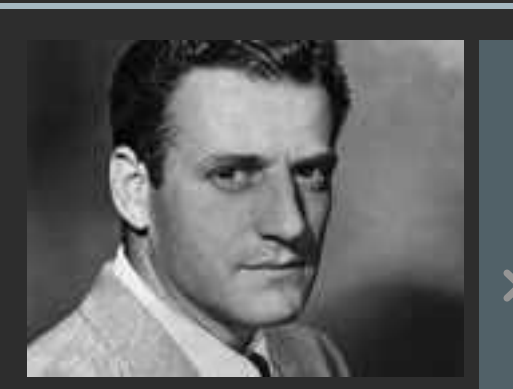
This Day in Jewish History, 1913 // Birth of Liberal Filmmaker Nc ...