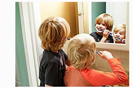
Oral Health and Your Child: 6 Things to Know