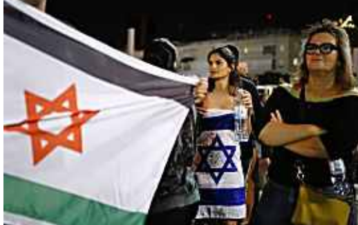
Haaretz | Opinion

How Your Morning Coffee Can Affect Your Heart!