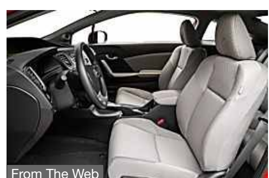
Kelley Blue Book

Five Decades of Occupation Have Created a Sort of Israeli-Palestinian Identity